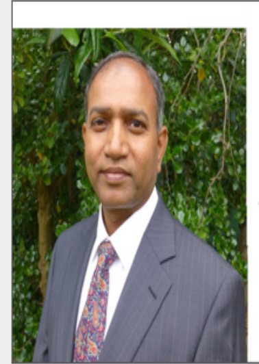
Social Development Free