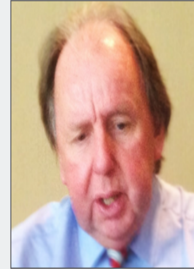
Child Welfare Free